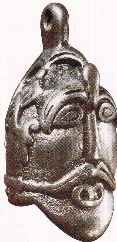
Silver pendant showing the helmet of the Vendel (Early Viking period, 10th century), Statens Historiska Museet, Stockholm

530 Then he saw, hanging on the wall, a heavy Sword, hammered by giants, strong And blessed with their magic, the best of all weapons But so massive that no ordinary man could lift Its carved and decorated length. He drew it 535 From its scabbard, broke the chain on its hilt,